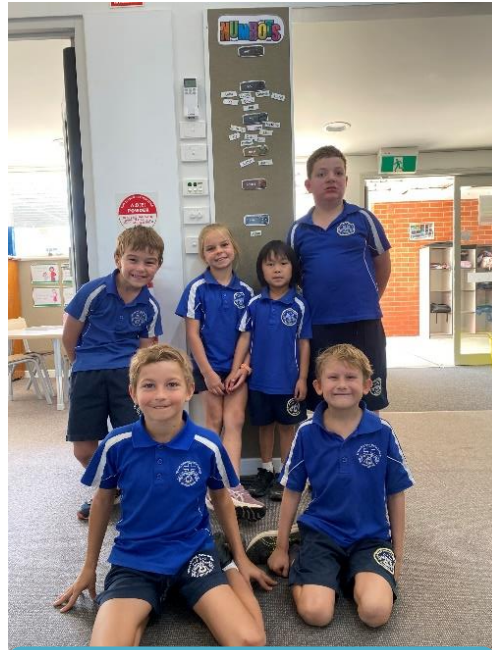
NUMBOT LEADER BOARD

We have our leader board up in class now to track our progress and each Monday we do a check in of levels and a mini presentation of level progressors.