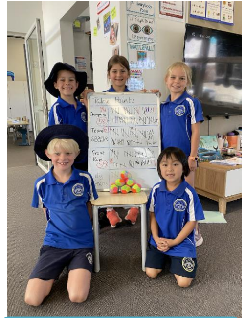
TABLE POINT WINNERS